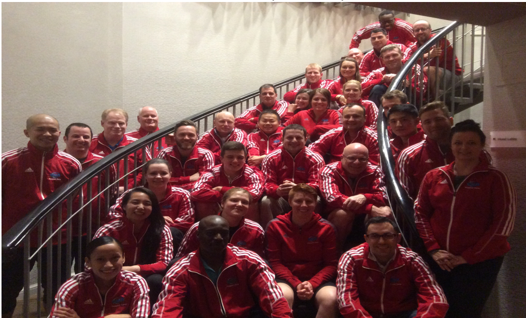
OUA/OABO Prospect Camp